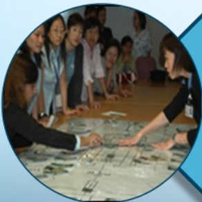
Table-Top Exercise (TTX) Workshop